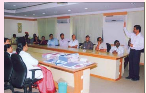
Technical session on medical education in progress