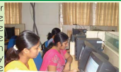
Online USMLE examination in progress

Undergraduate students intending to appear for USMLE and Andhra Pradesh Post Graduate Entrance test are being trained simultaneously with the routine medical training programme. On-line examinations are conducted every week as per the USMLE pattern in individual medical subjects, which are followed by discussion by the eminent faculties from the concerned subjects. contd. in page no. 2