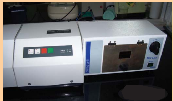
BIO-FUNCTIONAL PROSTHETIC APPLIANCE

The department of Prosthodontics of Narayana Dental College has been recently equipped with Prosthodontics Bio-functional Prosthetic Appliance. Incorporation of this equipment would enable more efficient denture construction in terms of quality, looks and durability as compared to normal dentures.