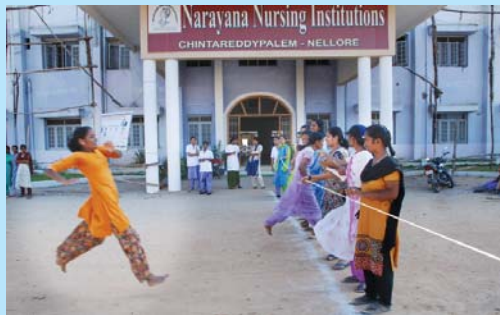
Sports event in progress