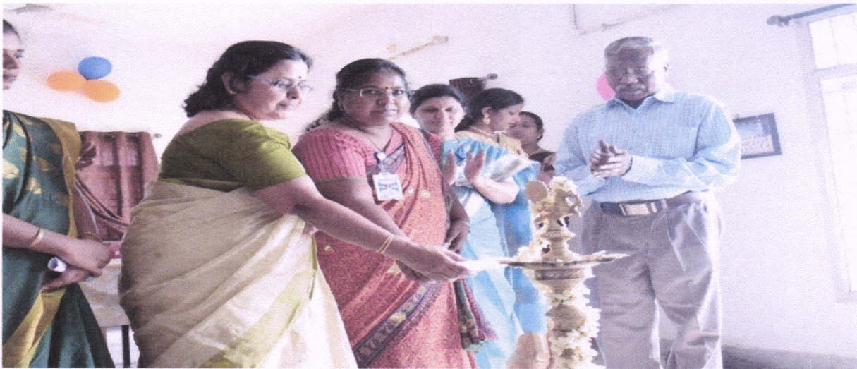
Fig:2 Lamp lighting by dignitaries