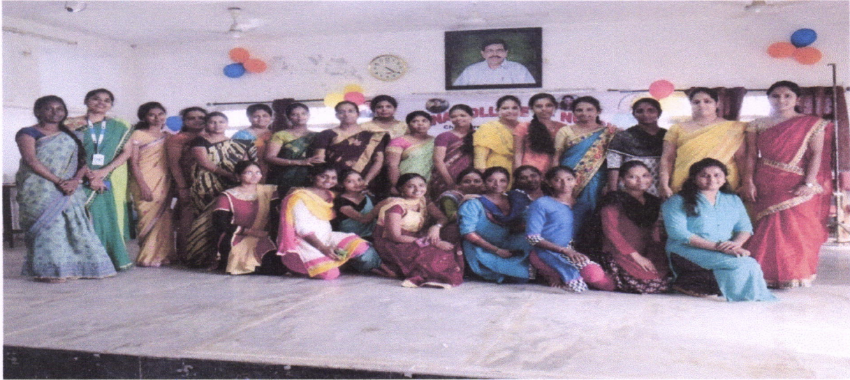
Fig:5 Alumni Gathering on Alumni Meet