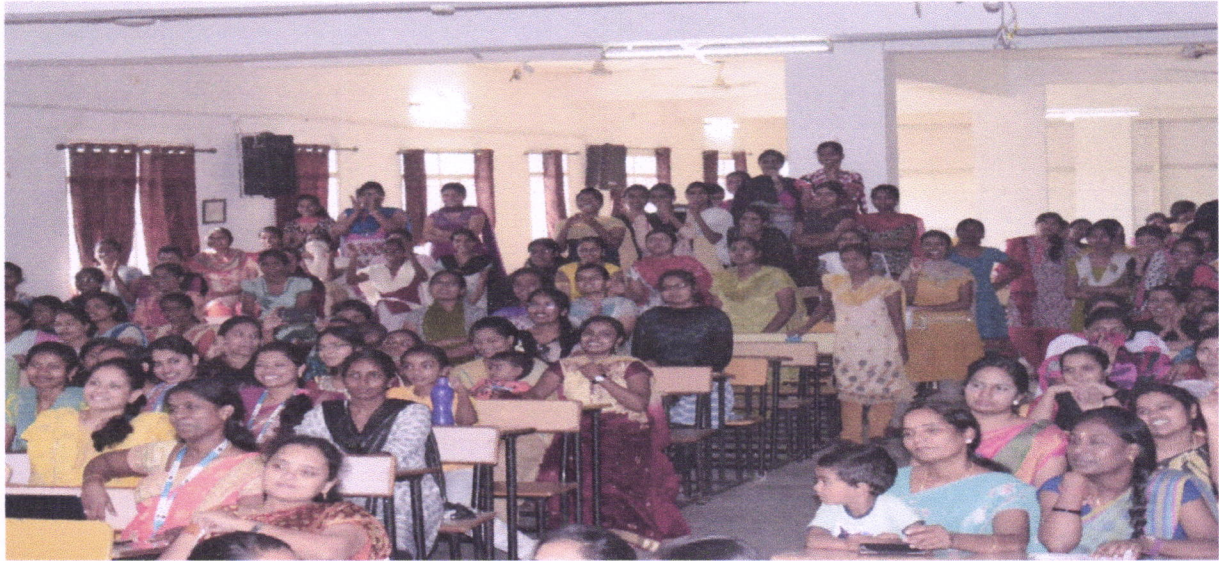
Fig:3-Current And Alumni Interaction