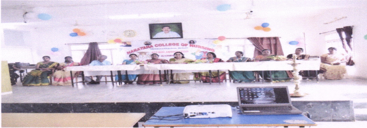
Fig: 1. All the dignitaries on the stage