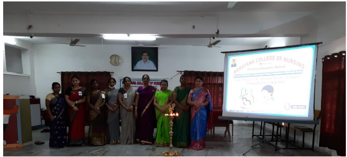
Celebration of Breast feeding Week

Chinthareddypalem, Nellore - 524003. A.P. Ph No: 0861-2317969 | Fax: 0861-2311968. Recognized by Indian Nursing Council and A.P. Nurses & Midwives Council Affiliated to NTR University of Health Sciences, A.P. Vijayawada. Accredited by "International Accredition Organization (IAO)" website: www.narayananursingcollege.com || e-mail: narayana_nursing@yahoo.co.in