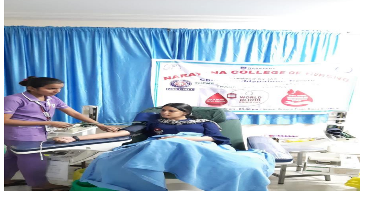
Students participated in donating their Blood

Chinthareddypalem, Nellore - 524003. A.P. Ph No: 0861-2317969 | Fax: 0861-2311968. Recognized by Indian Nursing Council and A.P. Nurses & Midwives Council Affiliated to NTR University of Health Sciences, A.P. Vijayawada. Accredited by "International Accredition Organization (IAO)" website: www.narayananursingcollege.com || e-mail: narayana_nursing@yahoo.co.in