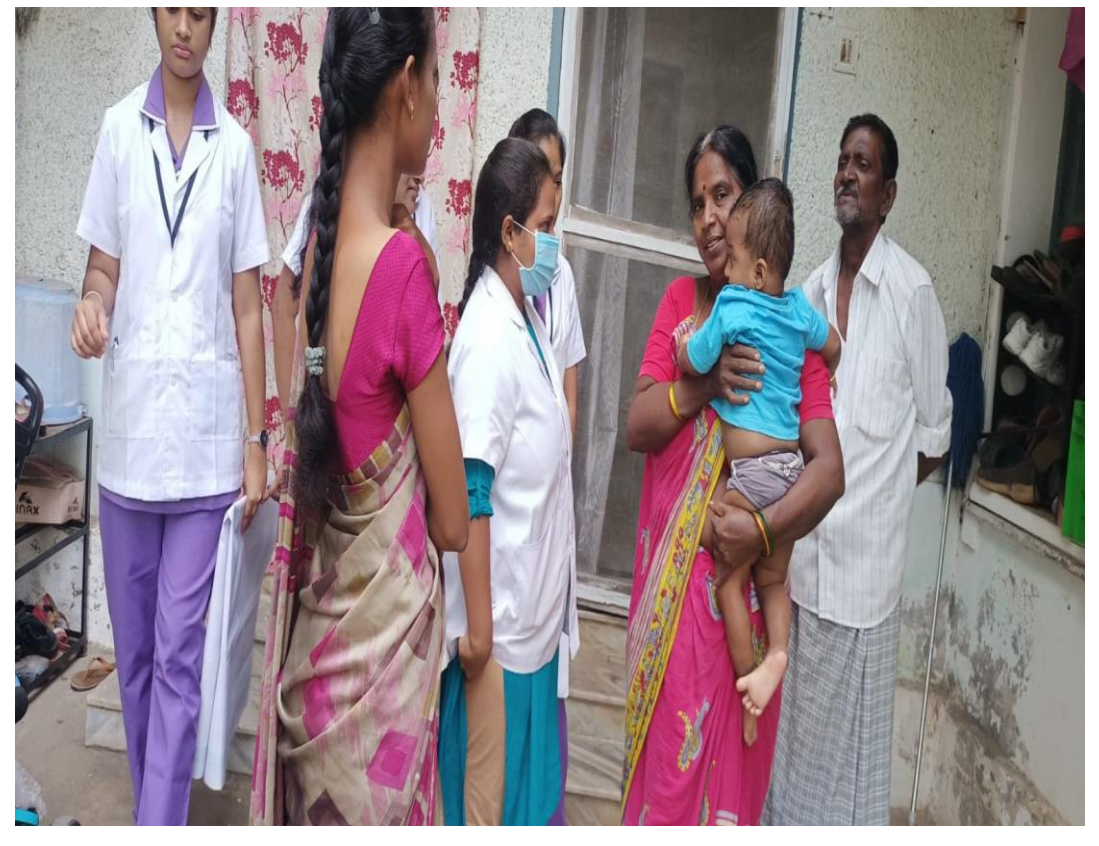
Students participating in Immunization program

COLLEGE OF NURSING Chinthareddypalem, Nellore - 524003. A.P. Ph No: 0861-2317969 | Fax: 0861-2311968. Recognized by Indian Nursing Council and A.P. Nurses & Midwives Council Affiliated to NTR University of Health Sciences, A.P. Vijayawada. Accredited by "International Accredition Organization (IAO)" website: www.narayananursingcollege.com || e-mail: narayana_nursing@yahoo.co.in