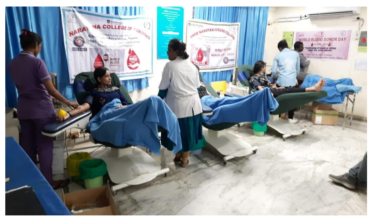
Students participated in Blood Donor Day