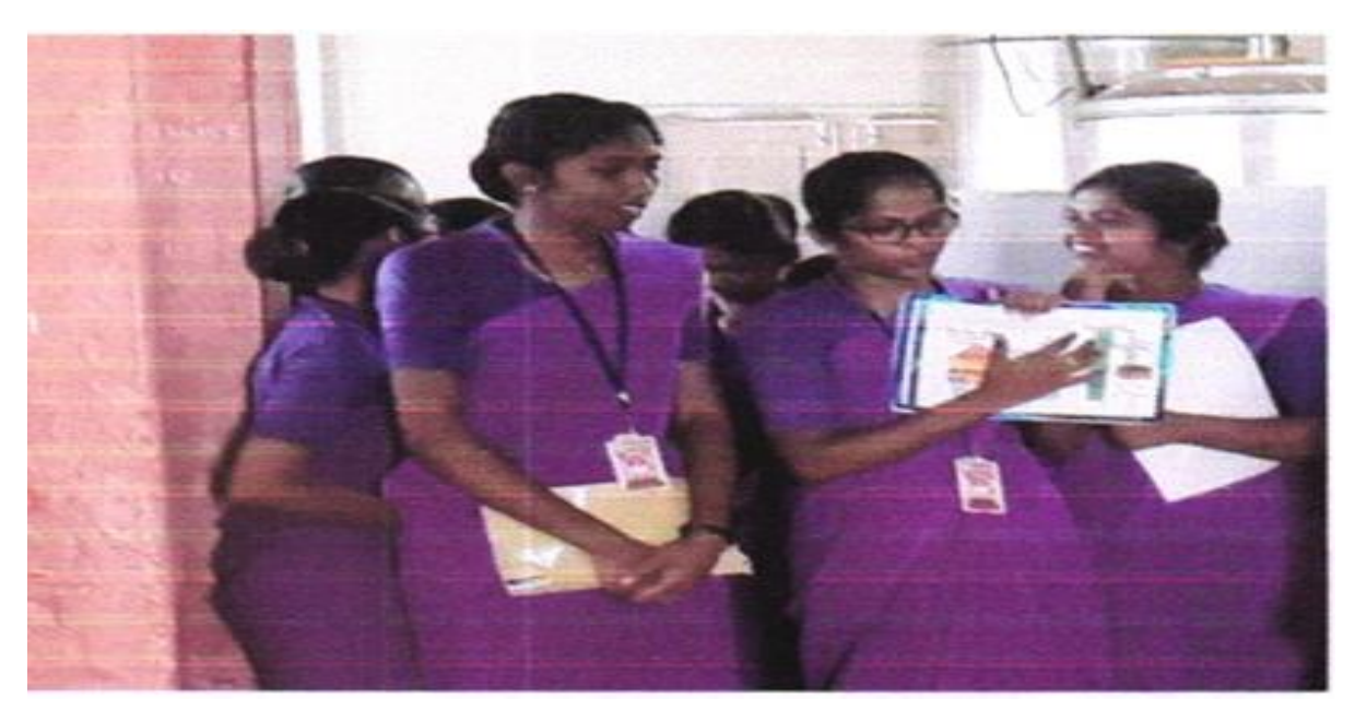
IV B.Sc(N) Students given awareness on Aids day by showing the charts