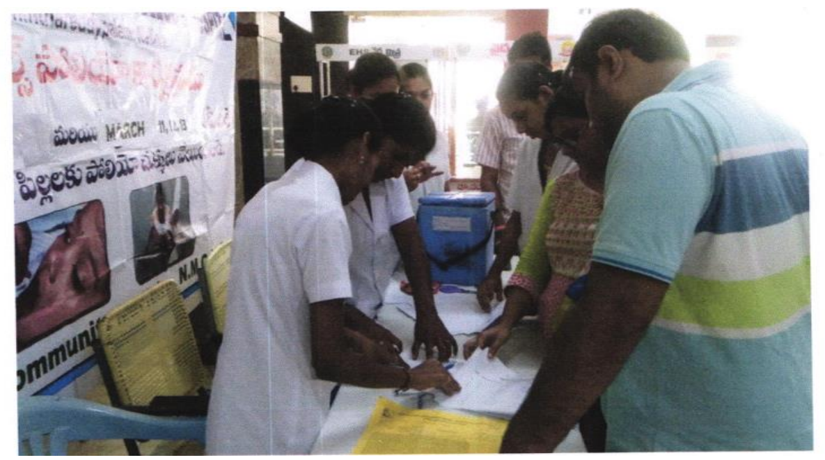
Students participating in Pulse polio program