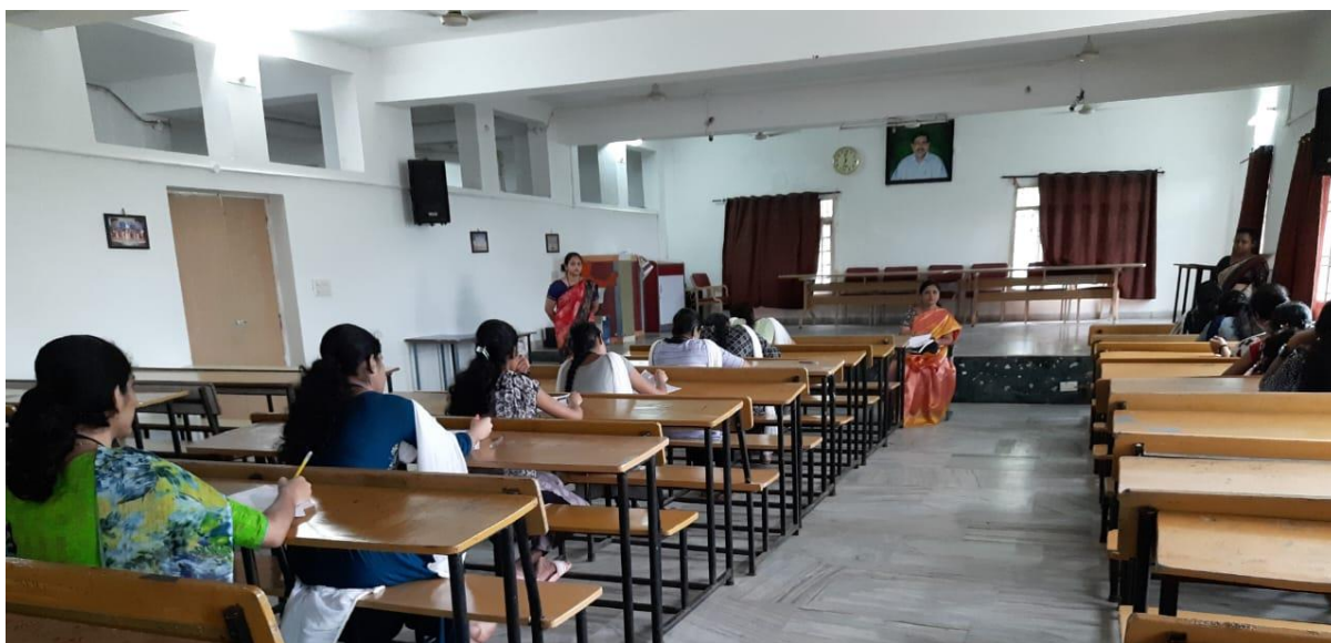
Students participated in Quiz Competition