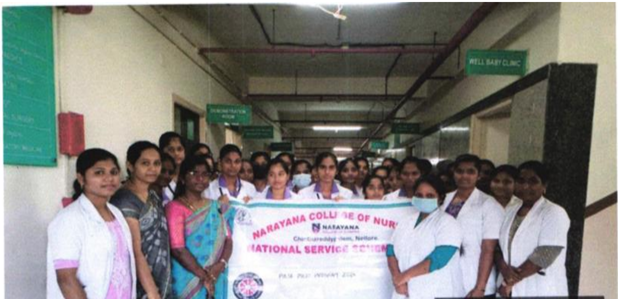
Faculty & Students Participated in Pulse Polio Program