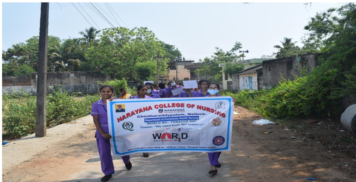
Rally conducted from harijanawada to health center