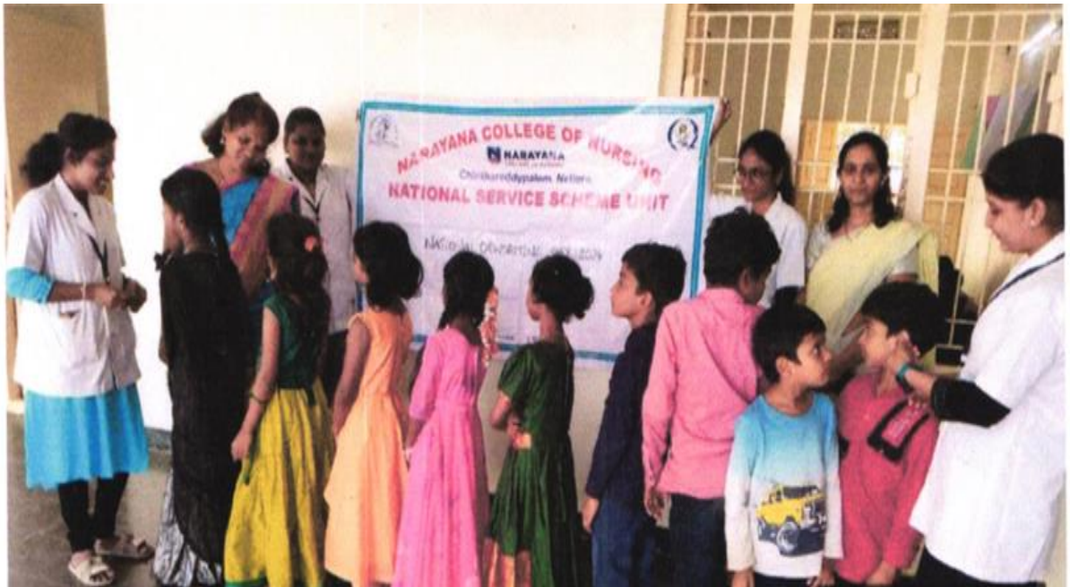
Celebration of National nutritional Week