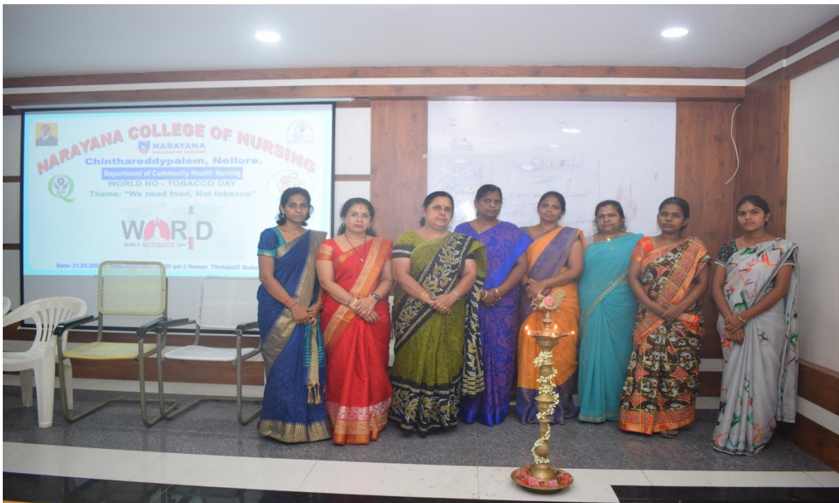
Lamp lighting by dignitaries in prize distribution ceremony on the occasion of world no tobacco day