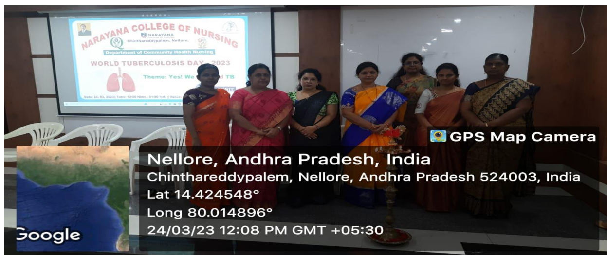
Lamp lighting by dignitaries