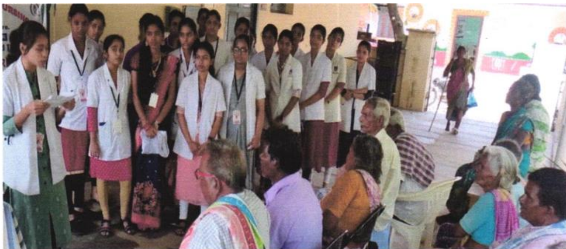
IV year B.Sc(N) given health education