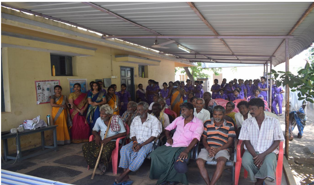
Public gathered on the occasion of world no tobacco day