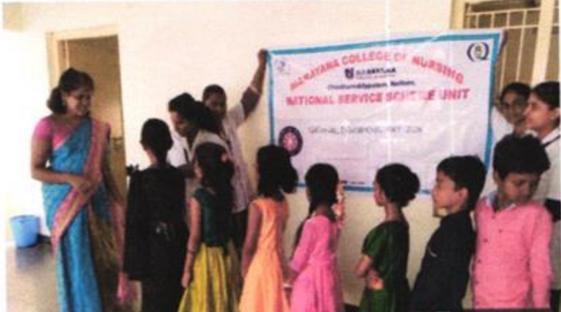
Msc I yr students participated in Immunization program