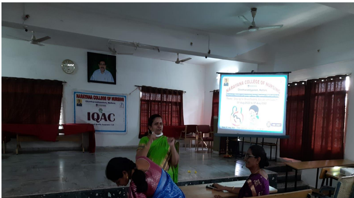
Breast feeding week Awareness program