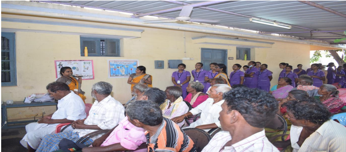
students are giving Health education by showing chart