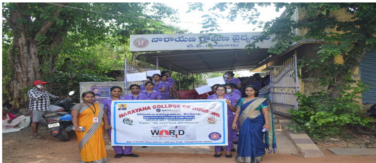
The NSS student volunteers and program officers started the rally from health center