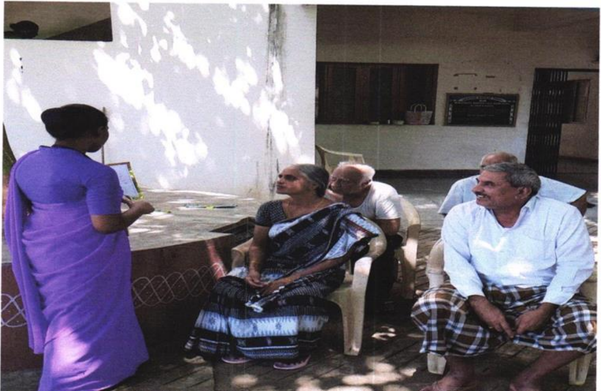
Students given health education on Leprosy