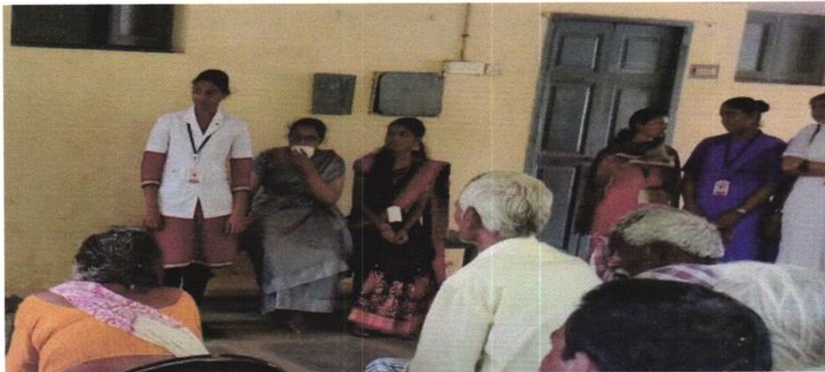
Students performed skit on prevention of Leprosy