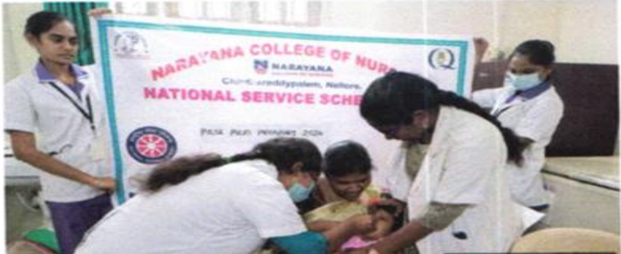
IV year B.Sc Nursing students participated in pulse polio program