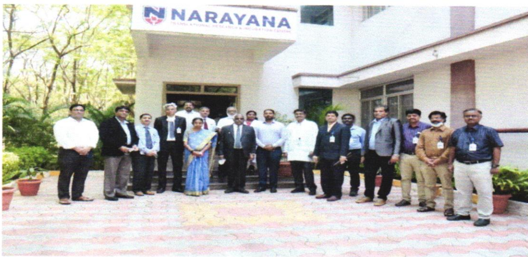
Incubation Innovation Inauguration