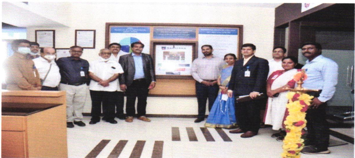
Incubation Management Team