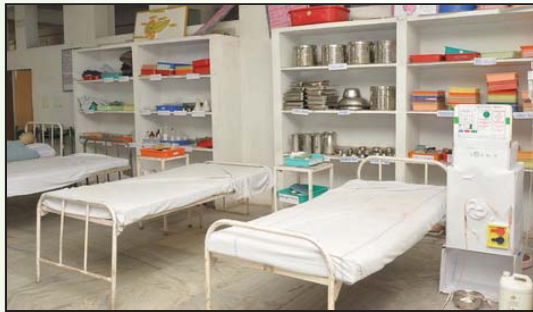
Medical Surgical Nursing Lab