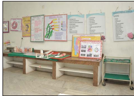
Medical Surgical Nursing Lab