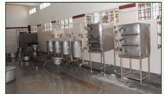
Kitchen with Latest Technology