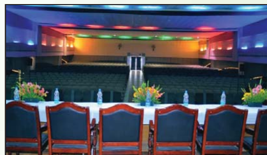
Air Conditioned Central Auditorium