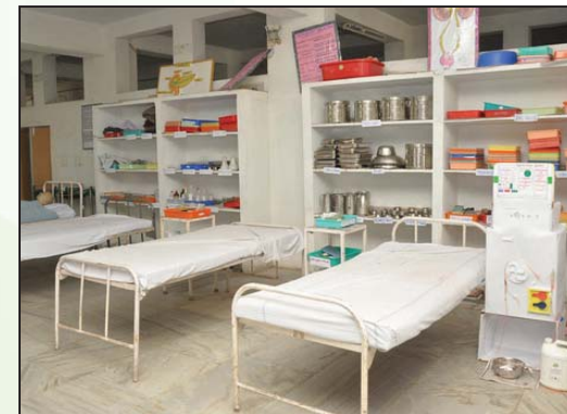
Medical Surgical Nursing Lab