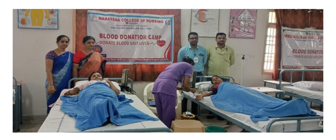
75th REPUBLIC DAY - 2024