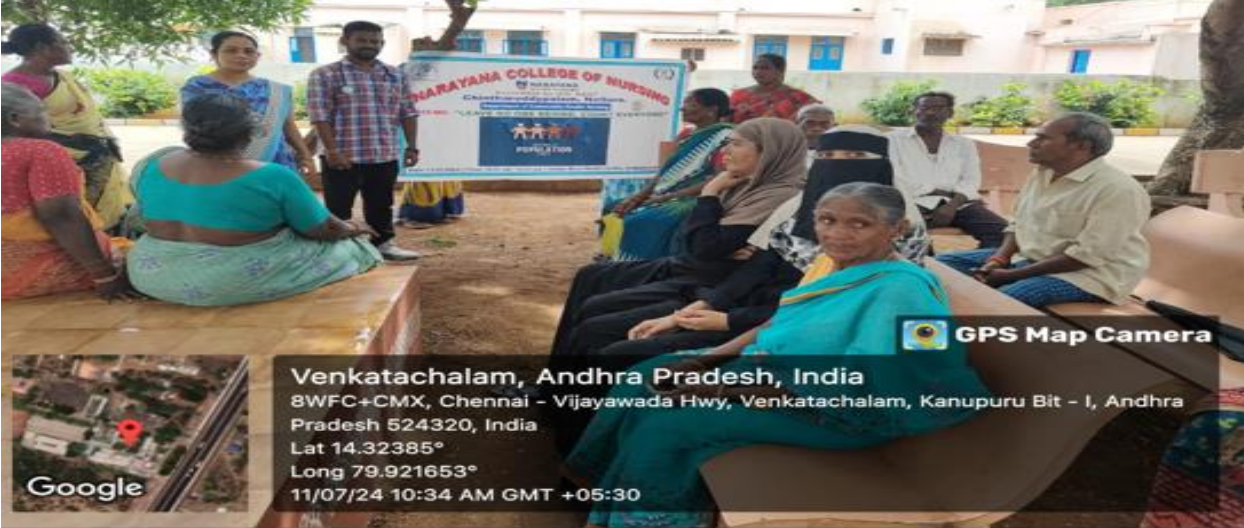
78th INDEPENDENCE DAY - 2024