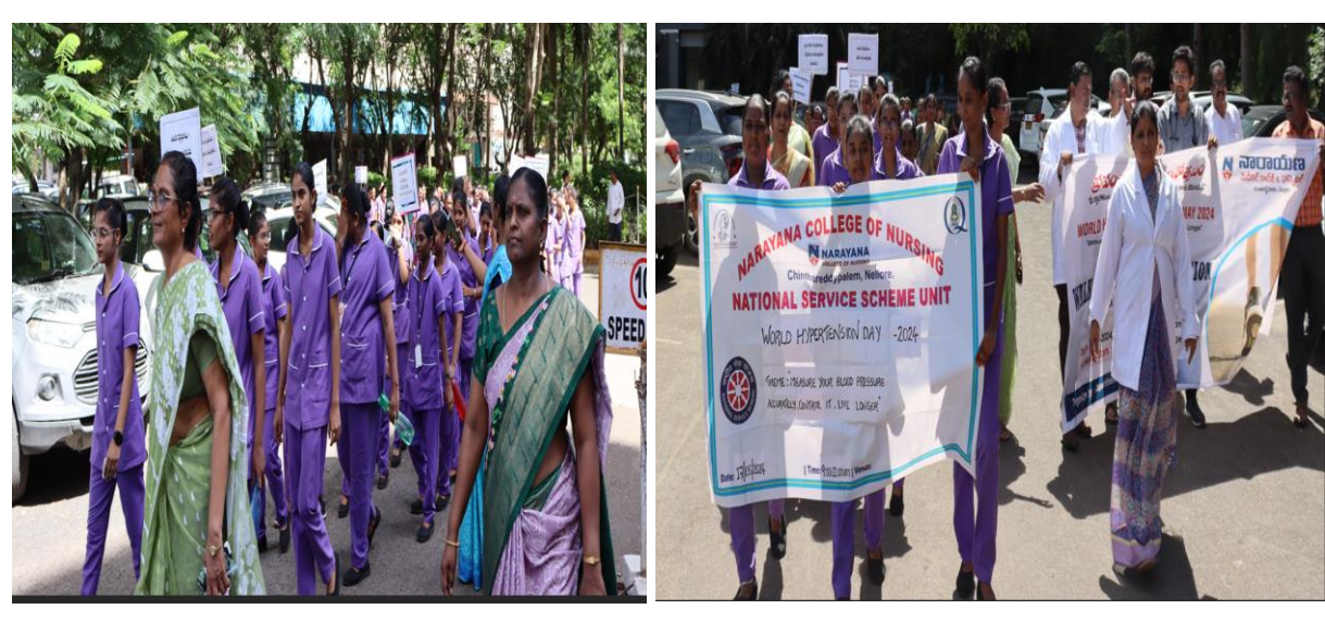
WORLD NO TOBACCO DAY, 31ST MAY, 2024