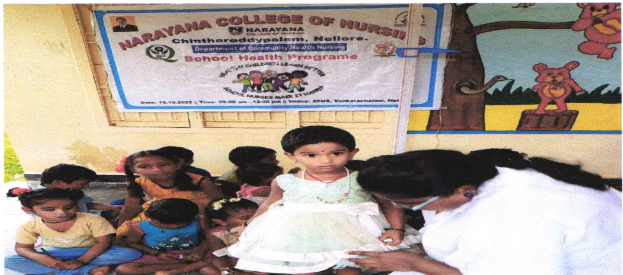
Fig:2Checking minor Disorders