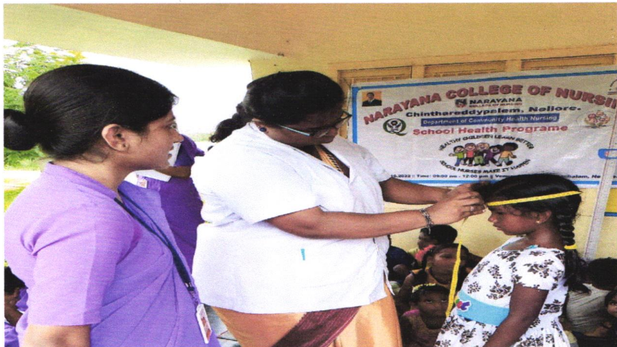
Fig: 3 CheckingAnthropometric Measurements

The MSc(N) students checked Anthropometric measurements for 50 school children like height, weight, mid arm circumference based on results 35 students were healthy, remaining 15 students were suffering