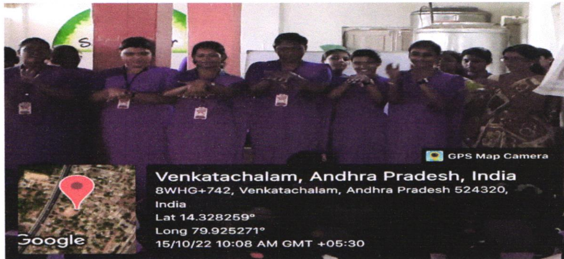
Fig:4 Students teaching who to do hand washing steps

with different deficiencies (mal nutrition) and also given health education on balance diet.