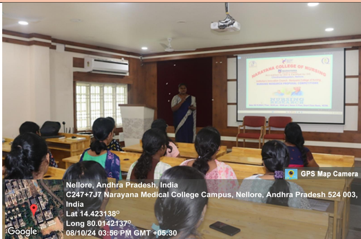
Fig: 1 M.Sc. (N) second-year students presenting their research proposals, 8/10/2024