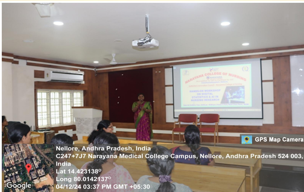
Fig: 1 The Faculty has given feedback about Digital Statistics