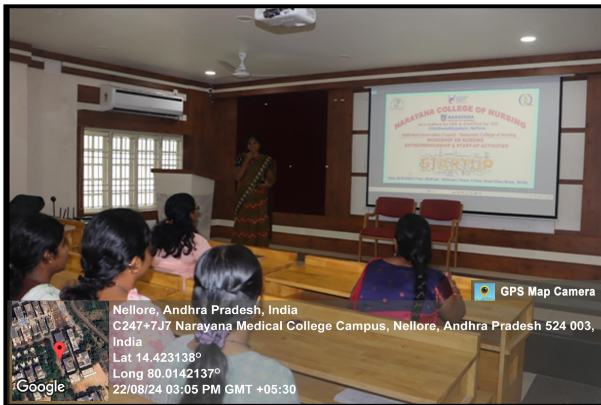
Fig: 2 The IIC Convenor expressed the gratitude to the Speaker, 22/08/2024

Sixty students and twenty faculty members benefited from the workshop and provided feedback, highlighting the importance of entrepreneurial skills.