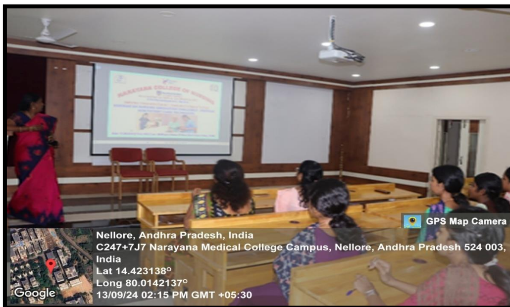
Fig : 1 The IIC member Explained the Health care techniques, 13/9/2024

Participants actively engaged in discussions, proposing new patient care techniques, innovative monitoring systems. The session was highly interactive, encouraging students and faculty to think critically about future advancements in nursing practice.