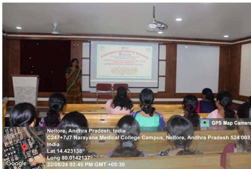
Fig: 1 The IIC Convenor emphasized the importance of entrepreneurial skills in nursing, 22/08/2024

The workshop provided valuable insights and motivation for aspiring nurse entrepreneurs, encouraging them to explore innovative career paths beyond traditional clinical roles. The event concluded with a vote of thanks, appreciating the speaker for her enlightening session and the participants for their enthusiastic involvement.