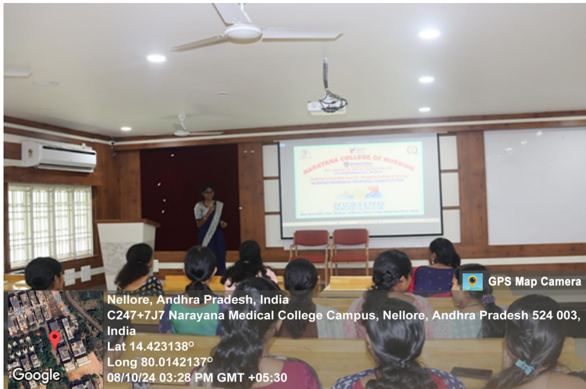
Fig: 1 M.Sc. (N) second-year students presenting their research proposals, 8/10/2024