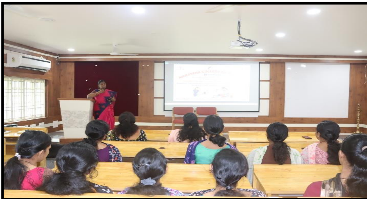
Fig : 2 The IIC member Explained the Health care techniques, 13/9/2024