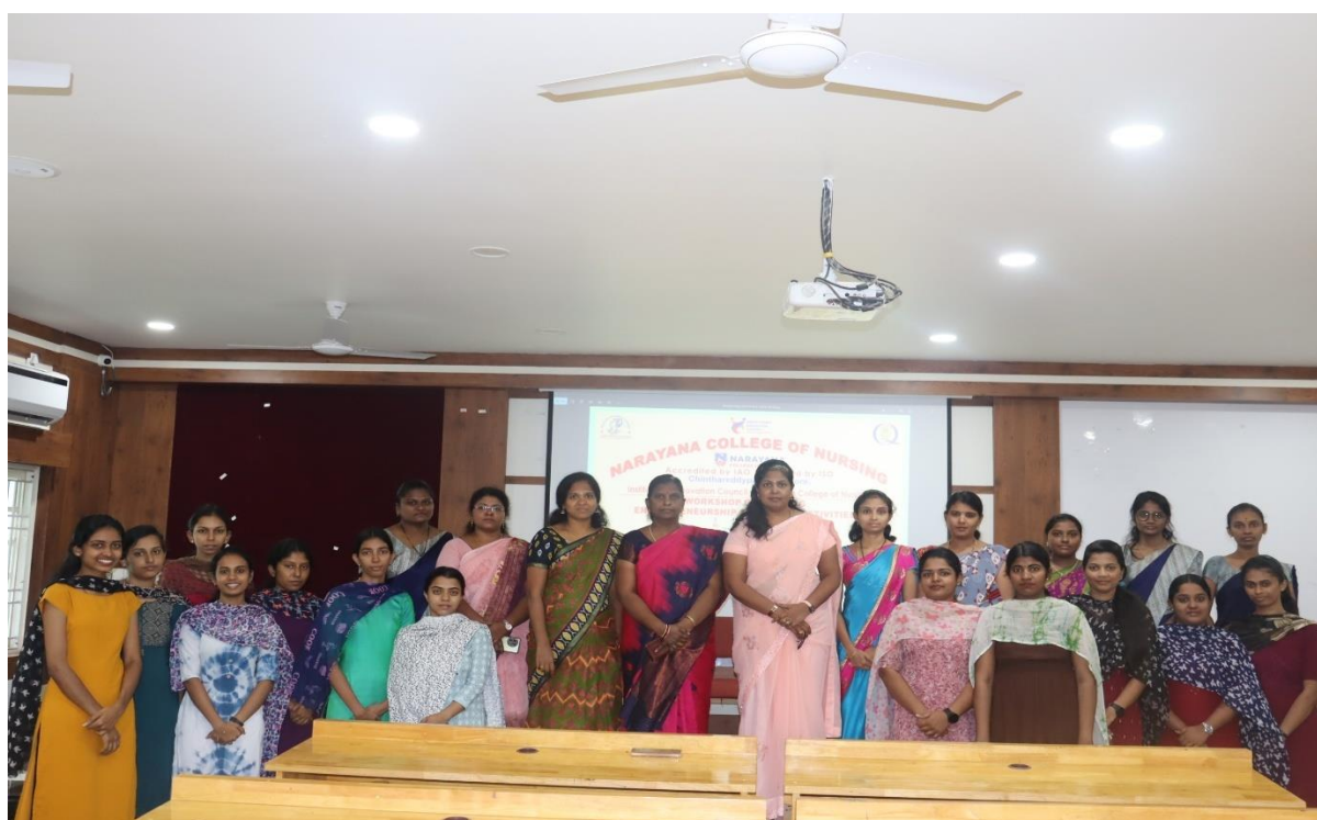
Fig: 2 Group Photo after the workshop, 4/12/2024