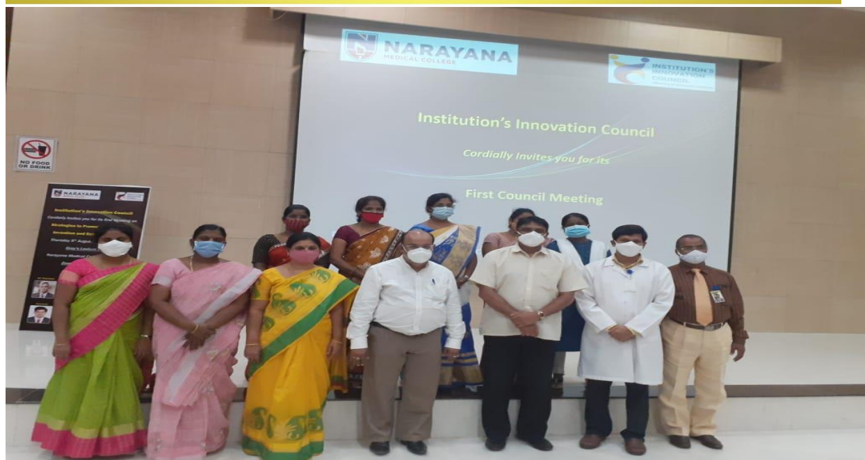
The Members of IIC Narayana College of Nursing