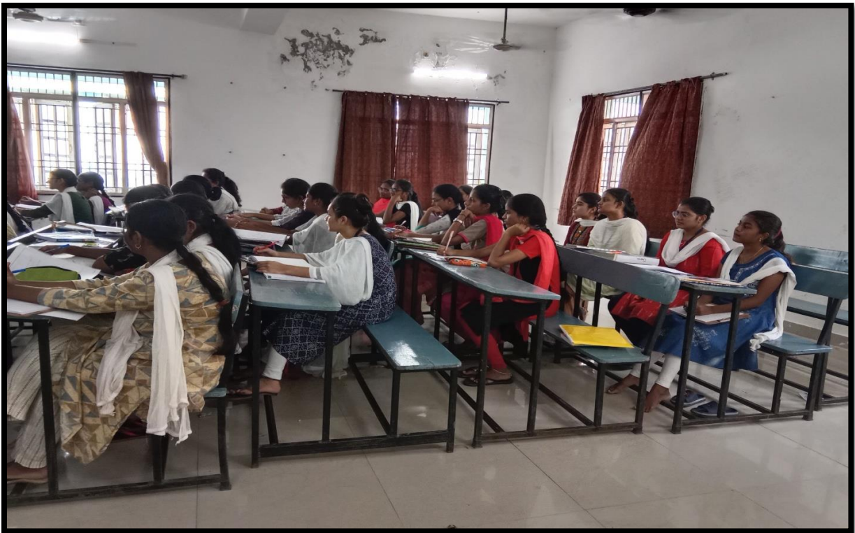
Fig: 1 Seminar on Promote interdisciplinary research projects, 28/9/2022

Dr. Latha discussed the critical role of nursing professionals in interdisciplinary research, particularly in areas such as patient safety and healthcare delivery innovations. The seminar encouraged participants to explore collaborative research opportunities, promoting a more integrated approach to solving healthcare issues.