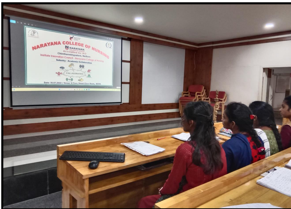
Fig: 1 Seminar on Industry-Academia Collaboration, 30/7/2022