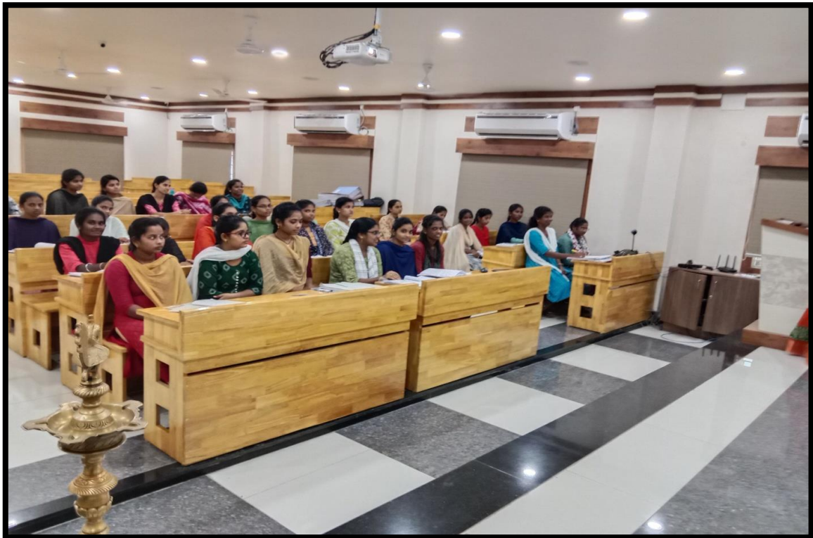
Fig: 1 Innovation Showcases and Exhibition session, 29/6/2022