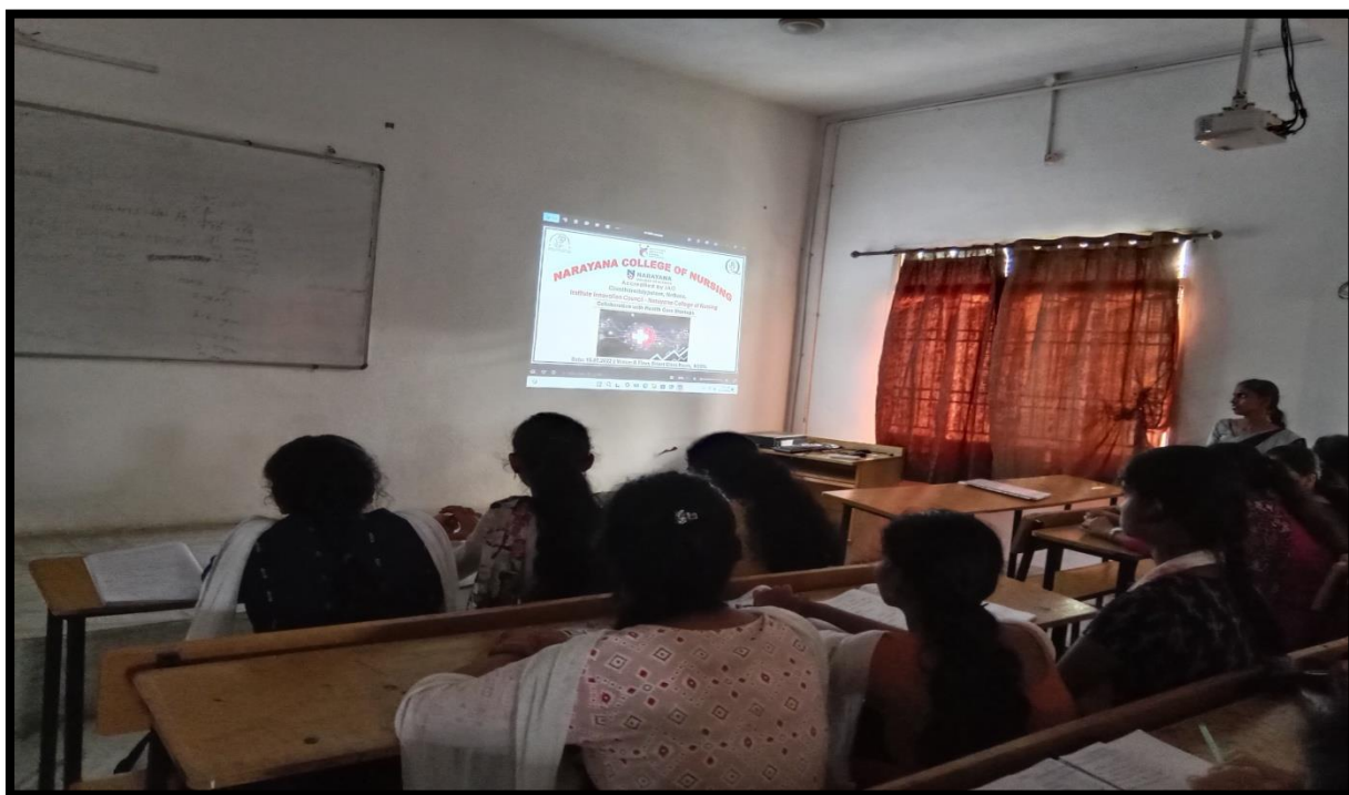
Fig: 1 Organizer welcomed the gathering for mentoring session, 16/6/2022